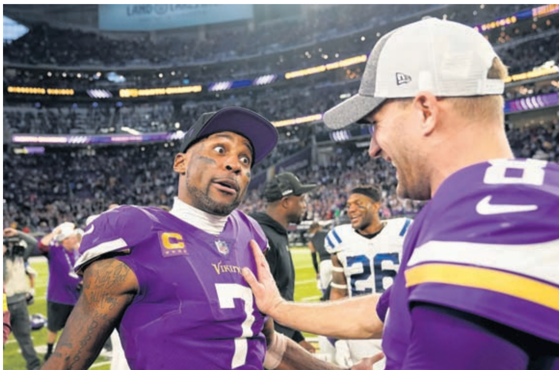
Minnesota Vikings cornerback Patrick Peterson (7) reacts with teammate quarterback Kirk Cousins, right, after an NFL football game against the Indianapolis Colts, Saturday, Dec. 17, 2022, in Minneapolis. The Vikings won 39-36 in overtime.

Inside the raucous locker room at U.S. Bank Stadium, eighth-year linebacker Eric Kendricks wiped away tears as he reflected on the spirit, resiliency and camaraderie of a team that has won 10 games by eight points or fewer this season. Rookie head coach Kevin O'Connell stepped off the podium following his media session in a fog of satisfaction and exhaustion, reflecting on cornerback Patrick Peterson's straight-faced halftime challenge to the offense "You just need five touchdowns" that helped set the tone. "I'll never forget it as long as I live," O'Connell said.